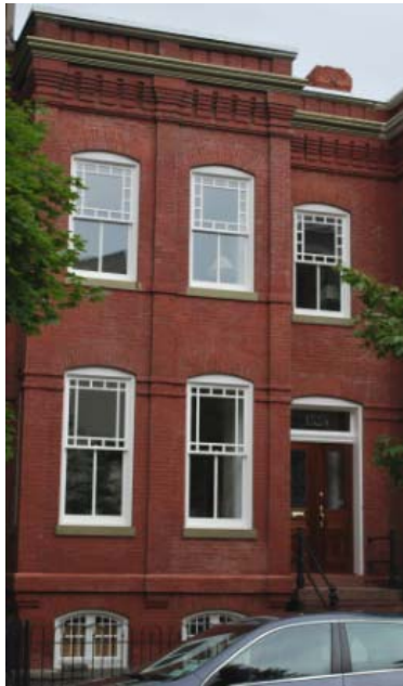
1520 O Street, NW

The building permit for 1525 O Street was granted on April 12 th 1884 to real estate speculator Curtis J. Hillyer. The permit stated that the estimated costs at that time would be $33,000 dollars to build six, single-family row houses. Each house was to measure 20' 9" in front and 45' in depth, and to be built by Fleming. 12