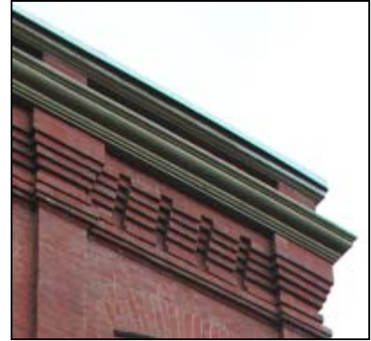
Decorative brick work along the roof.

The roofline of 1525 O has decorative masonry features that resemble a medieval fort, with two sets of parapets— a low cut wall that guides the roofline, guarding a cliff or sudden drop off— with one immediately over the second story and another, repeated on the third floor and set back from the immediate face of the building.